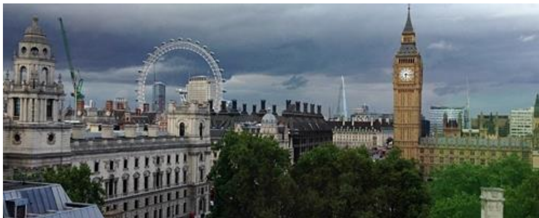
View from the QEII Centre

Following exceptionally positive feedback, the 2016 show will remain at central London's most prestigious, dedicated conference and exhibition venue - the QEII Centre.