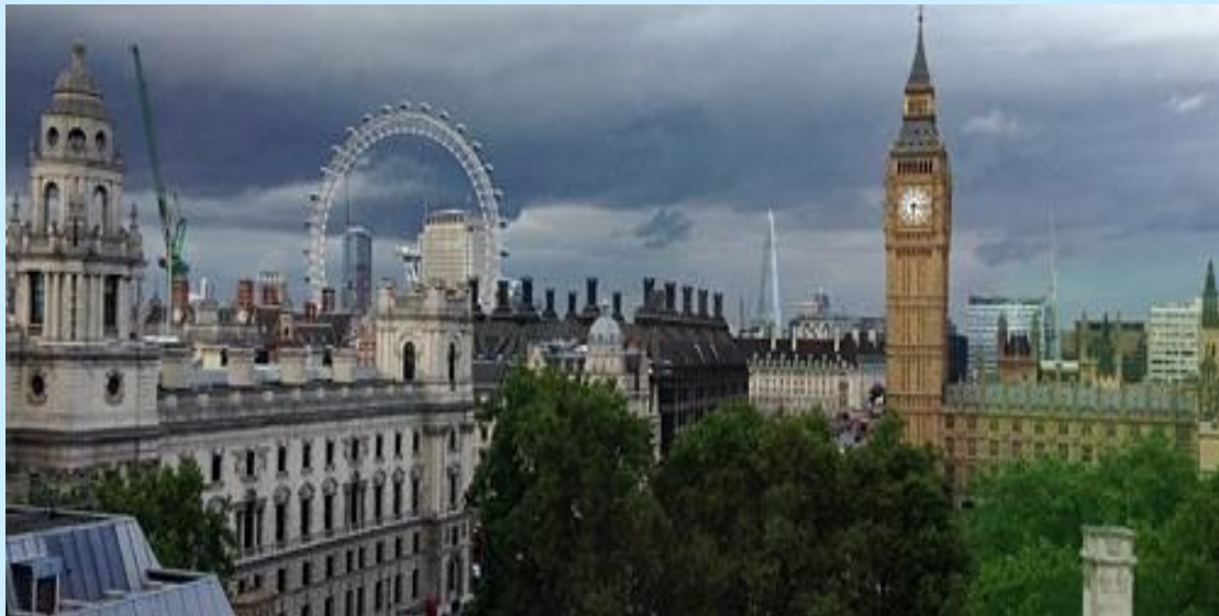
View from the QEII Centre

Following exceptionally positive feedback, the 2016 show will remain at central London's most prestigious, dedicated conference and exhibition venue - the QEII Centre.